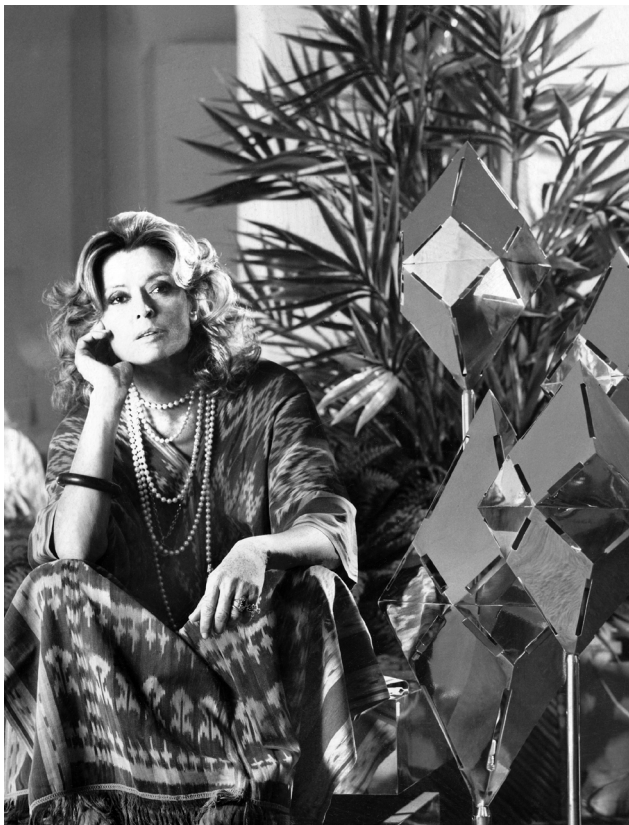
Gabriella Crespi among her Caleidoscopio lamps in 1974

Born in 1922, Gabriella Crespi embarked on a remarkable journey where she navigated through dynamic artistic periods and solidified her status as an unerring innovator. Throughout her illustrious career, her design philosophy was characterized by an understated elegance and futuristic elements, crafting a distinct oeuvre amidst a climate of artistic experimentation. In the 1970s and '80s, Crespi forged her own path as she was not interested in following the artistic currents of that period. Instead, she developed a completely novel aesthetic as she opted to play by her own set of ever-changing creative rules. This is visible in seminal projects such as 'Rising Sun' and 'Plurimi'.