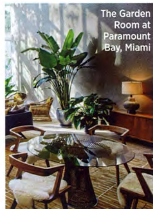
The Garden Room at Paramount Bay, Miami

Lenny Kravitz, who made his interior design debut a decade ago, when he started his own firm. “People had a lot of flair.” Taking inspiration from the likes of Miles Davis and Gordon Parks, the rocker turned Renaissance man creates interiors with soulful elegance: