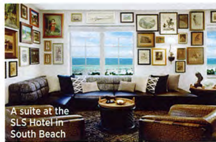
A suite at the SLS Hotel in South Beach

trawling the flea markets in Paris for antiques or hunting for quirky modern pieces at Todd Merrill’s shop in New York, though he says that ultimately, the driving force behind his aesthetic is a sense of comfort and ease. “A lot of design looks great in pictures, but when you go hang out in it, it’s not functional. I learned that very early on. So I try to create spaces that are just so comfortable and laid-back that you never want to leave.” Lindsay Talbot