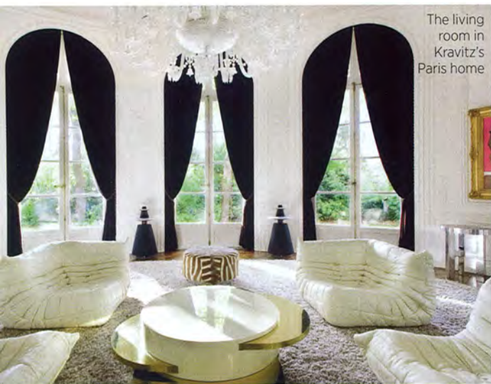
The living room in Kravitz's Paris home

“It’s definitely got to be maximum vibe,” he explains. “Sexy and warm—sophisticated yet still approachable.” Splitting his time between a town house in Paris’s 16th Arrondissement, a customized Airstream trailer and recording studio in the Bahamas, and an organic farm in Brazil, Kravitz has designed penthouse suites at the SLS Hotel in Miami and crystal chandeliers for Swarovski—as well as collaborated on Mademoiselle chairs for Kartell, with his design mentor Philippe Starck. He can often be found